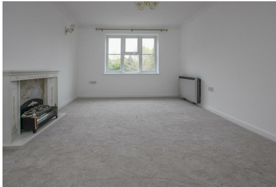
36 Queenswood House Eastfield Road, Brentwood, CM14 4HF

Whilst every attempt has been made to ensure the accuracy of the floor plan contained here, measurements of doors, windows, rooms and any other items are approximate and no responsibility is taken for any error, omission, or mis-statement. This plan is for illustrative purposes only and should be used as such by any prospective purchaser. The services, systems and appliances shown have not been tested and no guarantee as to their operability or efficiency can be given Made with Metropix ©2019